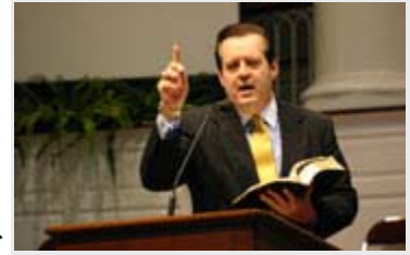
Richard Land of the SBC Ethics & Religious Liberty Commission spoke of the balance between pastoral and congregational roles in addressing New Orleans Seminary's "Issues in Baptist Polity" conference.

"Could you learn to see conflict as a gift from God?" Durst asked.